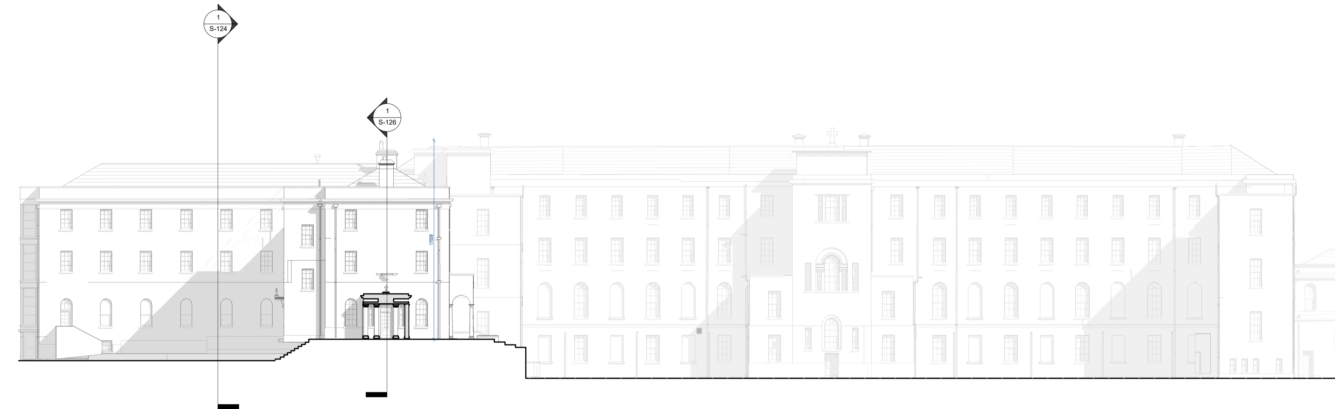
1 Seminary Building - East Elevation-Survey Scale - 1:200